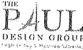
Exhibit 1 – Letter of Assent